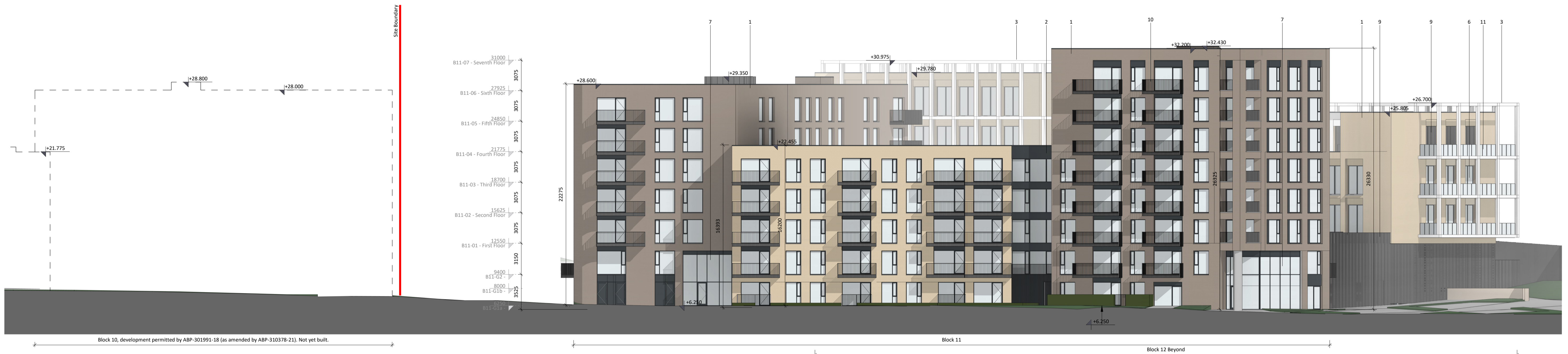
1 B11 & B12-South East Elevation 1:200